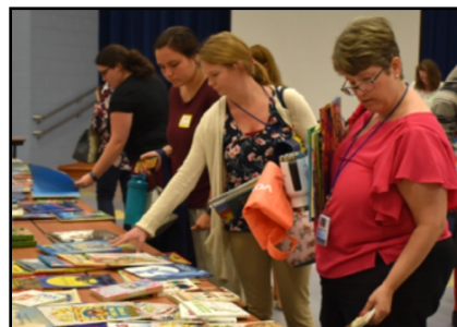
Large Local: Anne Arundel Books for Teachers