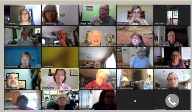
MRSPA President's Meeting by Zoom