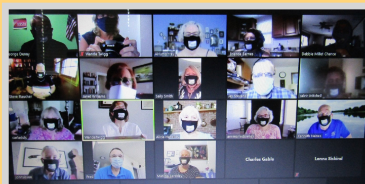
MRSPA Board of Directors Meeting by Zoom