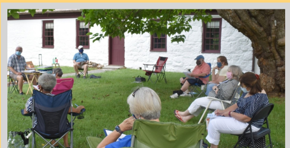
The Anne Arundel Retired School Personnel Executive Board met at the Anne Arundel Free School in July.